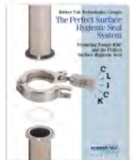
The Perfect Surface Hygienic Seal System Torque-Rite® #RF-150

Rubber Fab Technologies Group is a member of: