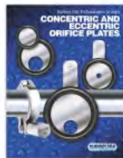
Concentric and Eccentric Orifice Plates #RF-130