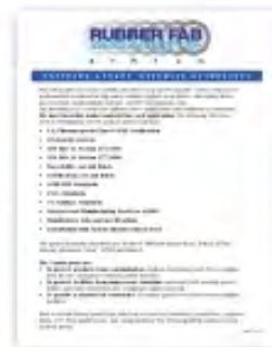
Hygienic Seal Material Guidelines #RF-140