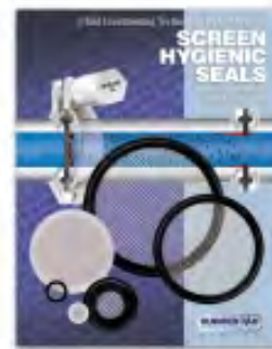
Fluid Conditioning Technology Screen Hygienic Seals #RF-110