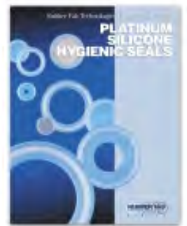
High Purity Platinum Silicone Hygienic Seals #RF-170