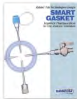
In Line System Validation Smart Gasket #RF-100

For detailed information on any Rubber Fab hygienic seal or product line and ordering information, contact Rubber Fab Technologies Group directly at (973) 579-2959 for your local distributor. For literature, email your requests to sales@rubberfab.com or download a specific brochure at www.rubberfab.com .