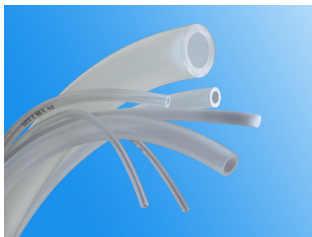
C-Flex® comes in a wide variety of sizes and formulations.

The performance of tubing in peristaltic pumping applications is affected by the conditions of use and equipment utilized, along with size and all thickness of the tubing tested. The data above is presented for information only and should not be utilized for specification purposes.