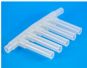
One-piece overmolded C-Flex® manifold maintains inner bore diameters with superior reliability and product integrity.