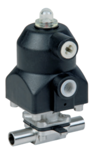
Cf. 1, 2 & 3