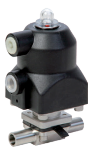
Cf. 4, 5 & 6