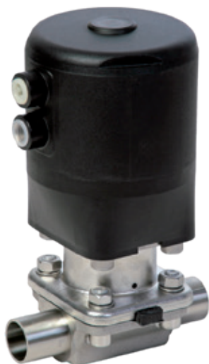
Cf. 4, 5 & 6