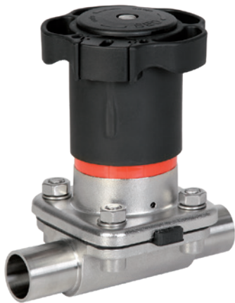
KMA 905 , S11