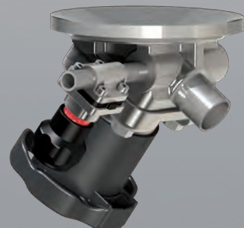
Welded sampling unit on request