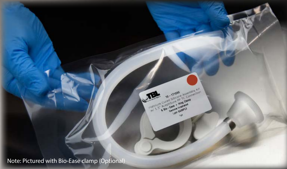
Note: Pictured with Bio-Ease clamp (Optional)

aSURE™ WFI samplers are manufactured from medical-grade polypropylene and Cellgyn™ (TPE) materials.